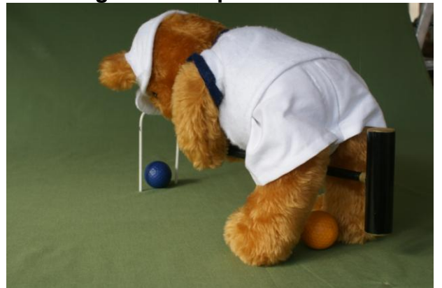
"Coach says..."Stand well forward, hit down hard and yellow should jump over blue so yellow scores the hoop". He doesn't expect much of me, does he!"