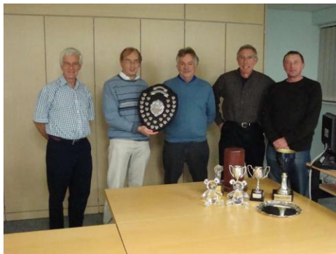
The successful 2010 Federation Team