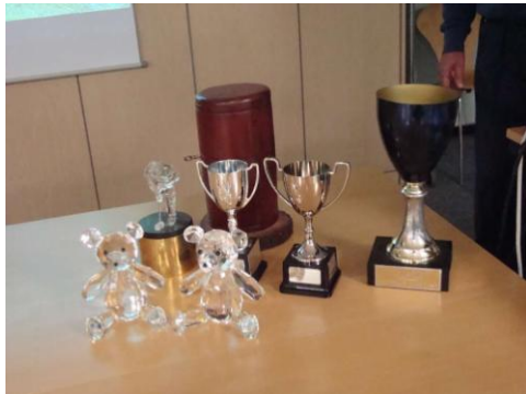
The club trophies we will be playing for this year.